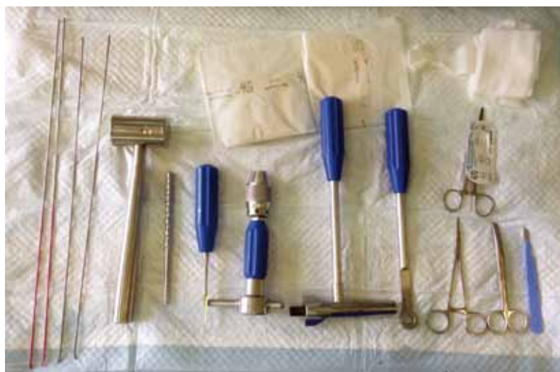
Fig. 1. Set of tools

gradual installation of rods with a turn of the ends of the rods "to each other" to create the maximum intraosseous tension in the fracture zone, and also to expand the interosseous space (fig. 2). In case the turn of the rod goes to the detriment of reposition, we chose the most correct position of the nail. Throughout the reposition, it is necessary to control not only the axial, but also the rotational displacement visually and radiologically (fig. 3). Next, the control performed X-ray, which allows us to control the position of the rod not only in the zone of fracture, but also all over the bones of the forearm. In case of violation it is necessary to determine the cause and eliminate it. After biting, the free end of the rods (about 1 cm) "fits" on the surface of the bone.