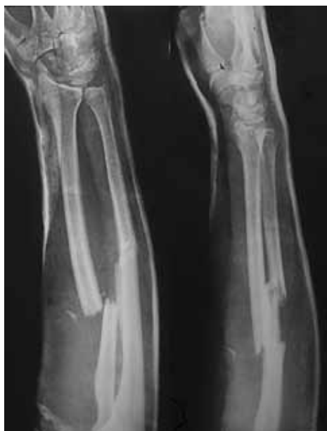
Fig. 4 Patient A., 16 y.o. X-ray of the forearm bones – comminuted diaphyseal oblique-transverse spiral both-bone fracture

process was carried out in a continuous mode and the child fully utilized the injured limb in normal mode. With 5 days of post-operative patients were allowed to flexion and extension at the elbow, with 10–14 days — flexion and extension at the wrist joint, and from 3–4 weeks after the operation was being developed rotational motions after the formation of primary bone regenerate. Against this background, there were no contracture of the wrist and elbow joints, and there was also a satisfactory volume of rotational movements.