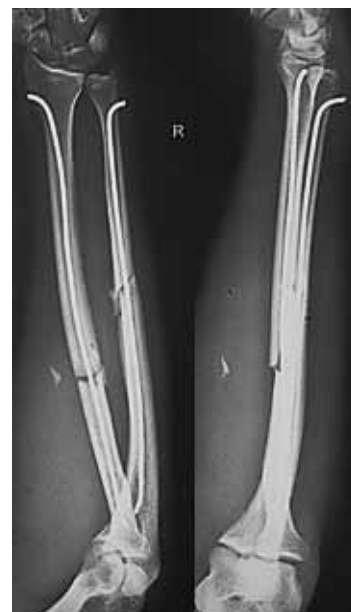
Fig. 5. The same patient. Control X-ray